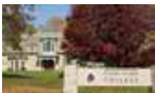
Rhode Island College