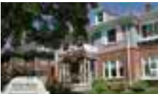
Idaho State University