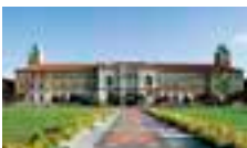
Texas Tech University