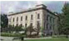
Indiana State University