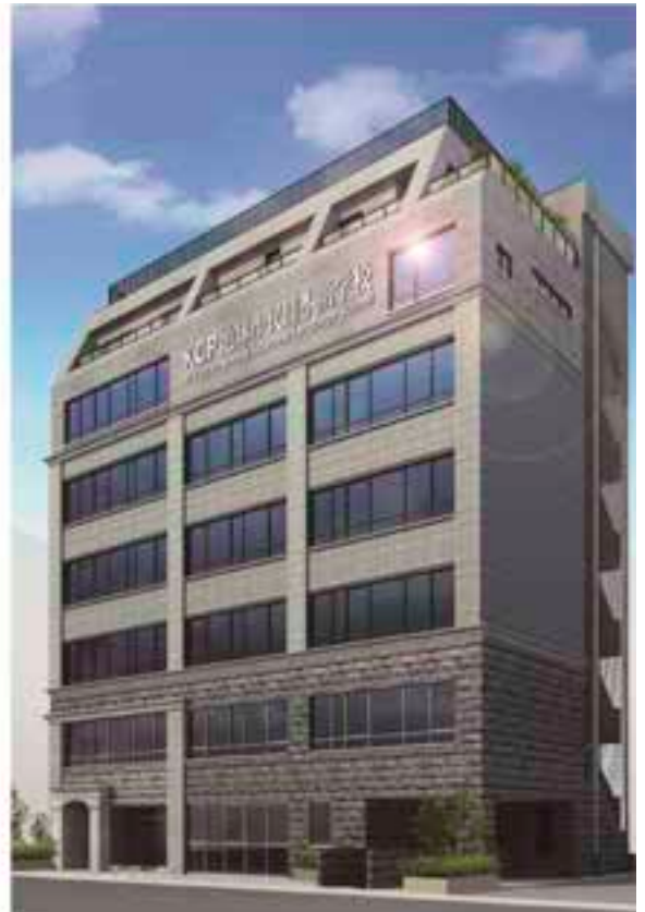
KCP Campus in the heart of Tokyo