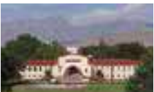
New Mexico State University