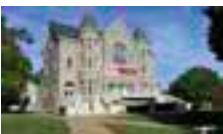
Virginia Union University