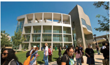
Cleveland State University

These universities grant academic credit to students who are enrolled at them.