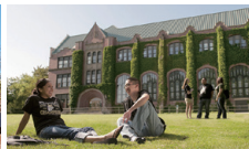
University of Idaho