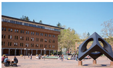
Western Washington University

These universities grant academic credit to students enrolled at them and can also grant transfer academic credit to students from other colleges who apply to the KCP program through them.