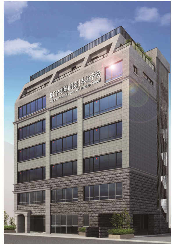
KCP Campus in the heart of Tokyo