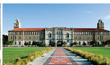
Texas Tech University