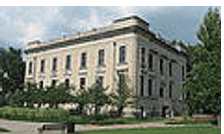
Indiana State University