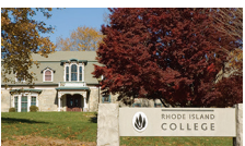
Rhode Island College