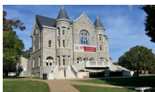
Virginia Union University