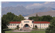
New Mexico State University