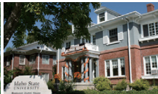
Idaho State University