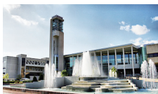
Missouri State University